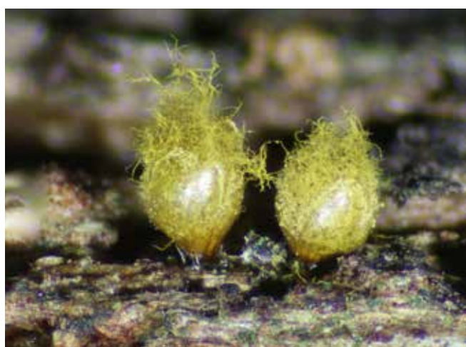
25 September 2019